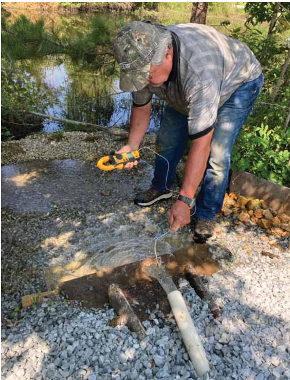
Checking incoming water temperature.

I will keep everyone posted on the progress of having a man-made fishing hole.