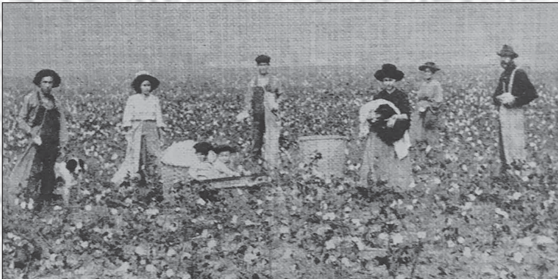
W. S. Bumpus Cotton Farm