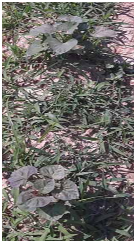
Before: My runaway garden.

I am just glad things are looking better and maybe I can take a little break for a while, but I am going to keep a watchful eye and not let the weeds take over again!