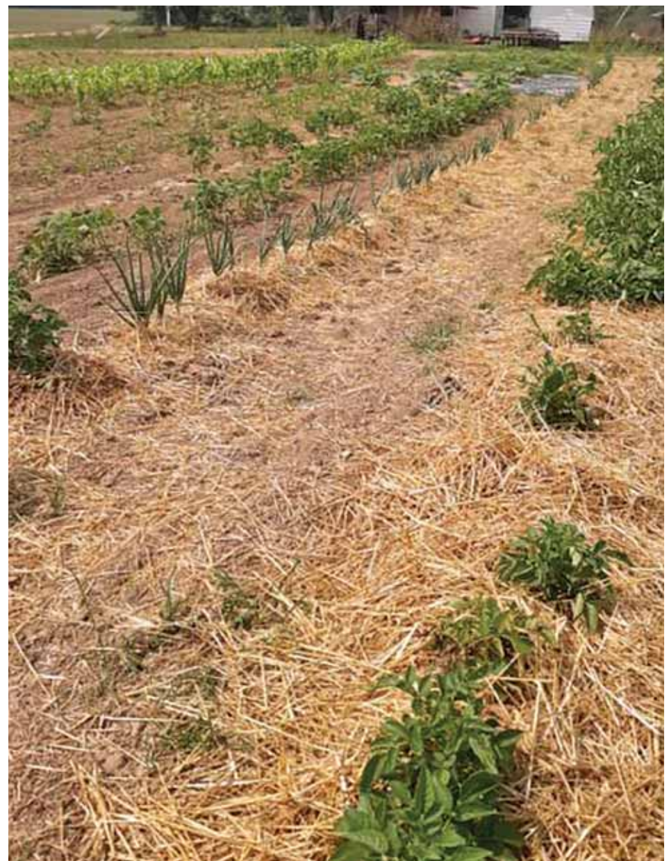
Garden looks much better after a lot of work.