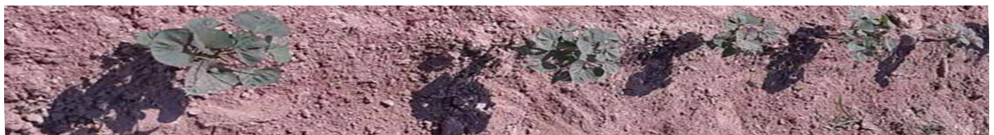
After: Clean garden.