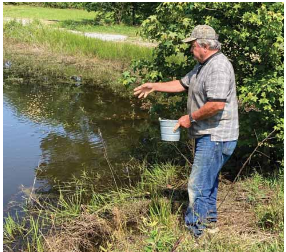
Feeding fish with good quality fish pellets.

Covering North Alabama With Quality Electrical Work